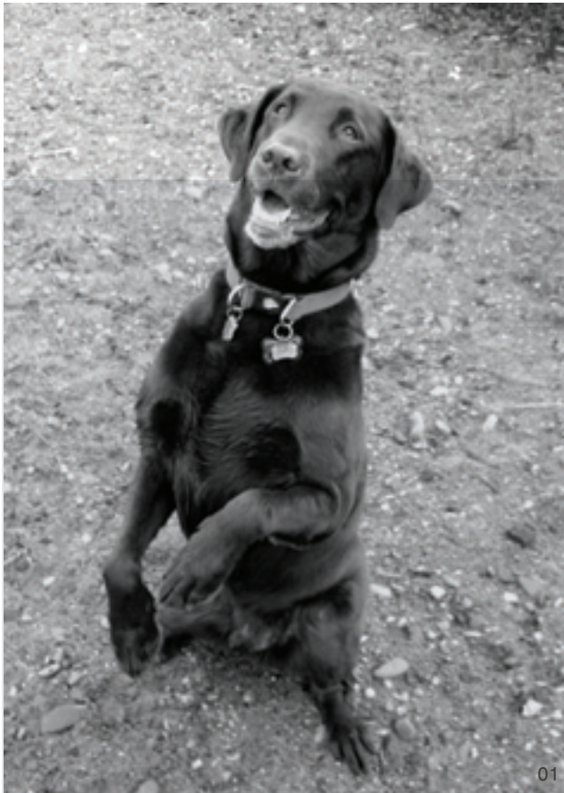
01 THE BLACK DOG 02 IN THE GREEN SAND FOUNDRY