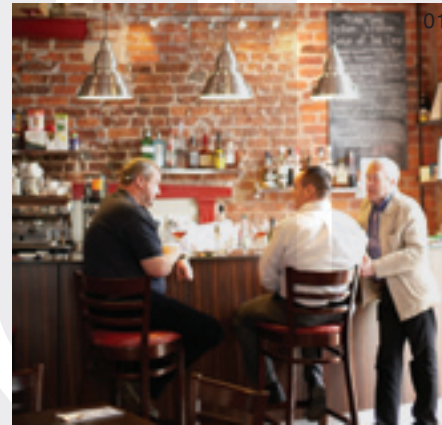
01\ THE ENGINE HOUSE 02\ WONDERWOOD

Sadly, Orange's merger with T-Mobile, announced last year, means that we will say goodbye to a great tenant who have been with us for 10 years in the summer. The imminent end of Orange's lease here in Leeds coincided with the business's need to consolidate from two premises to one. So we'll be sad to see the Orange team leave Marshalls Mill but we wish them well in their new work place. Happily, two other long-standing companies are close to renewing their tenancies... more to follow.